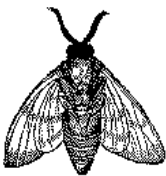
Figure 3: A sample black and white graphic that has been resized with the includegraphics command.

This sample document contains examples of .eps files to be displayable with LaTeX. If you work with pdfLaTeX, use files in the .pdf format. Note that most modern TeX systems will convert .eps to .pdf for you on the fly. More details on each of these are found in the Author's Guide .