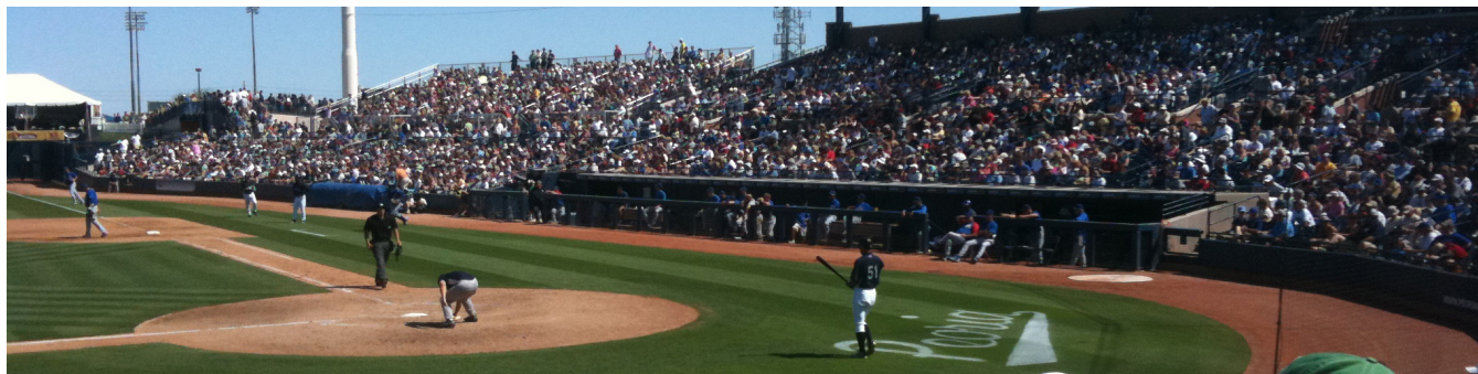
Figure 1. This is a teaser